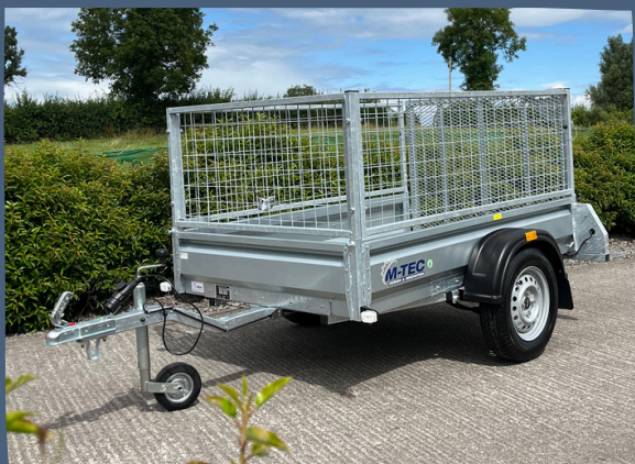
6FT x 4FT

M-TEC Single axle range offers a trailer which is cost effective as lightweight to tow yet The M-Tec Single Axle range is unrivalled in terms of performance, reliability, and features. This innovative range has been designed to be lightweight for easy towing and manoeuvring without compromising on strength. The solid axle-beam & spring leaf suspension ensure our trailer will meet the demands of our customers. With each trailer having a Towing Capacity of 750Kgs, no trailer license is required to tow our Single Axle range.