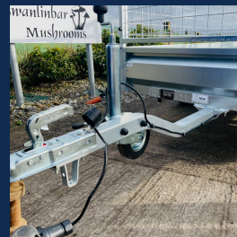
Swan neck tow bar for easier turning ability