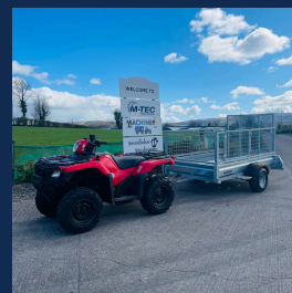
Dual use. Quad can tow or be towed