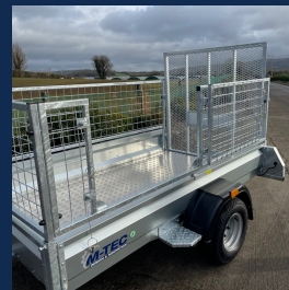
Side opening gate and step for ease of access