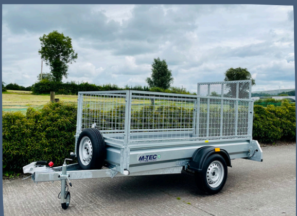
8FT x 4FT