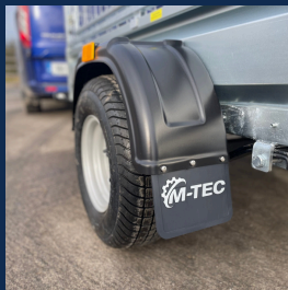
On/Off Road Tyre